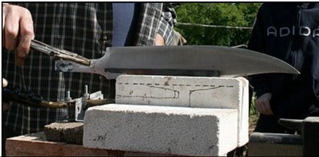
The soft back tempering gizmo is being heated as the blade is worked back and forth. More details on this at the meeting on Thursday evening.

work in the little forge and using finishing heats and some wet hammering managed to get most of the scale off of the blade. By then the sun was getting to me so I focused on circulating around and taking pictures.