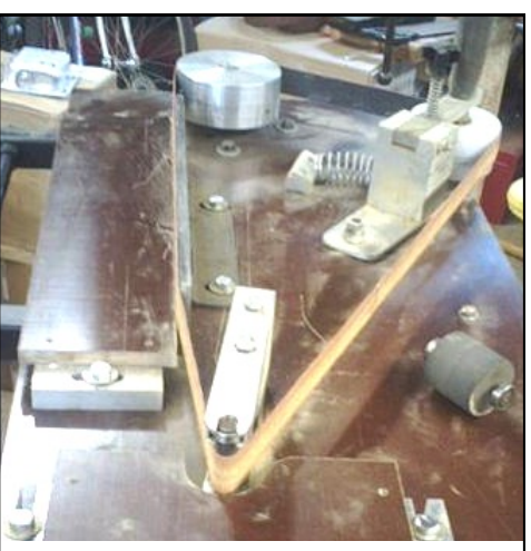
Lynn's horizontal belt grinder.

But another probable cause that several folks noted was that the blade is asymmetrical in that one face has a deep fuller