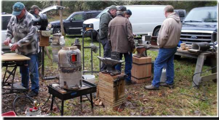
Forges being fired up...