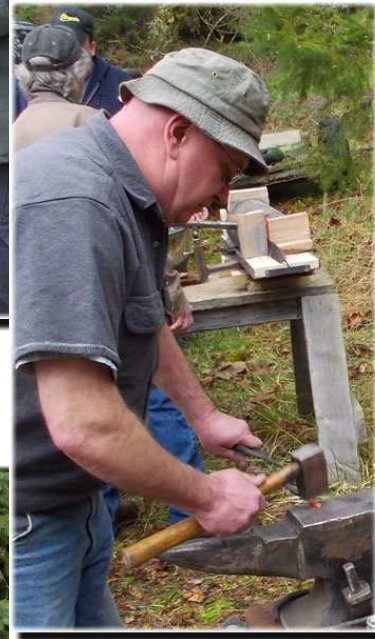
Some people got right to work – and of course a worker needs a couple of supervisors!