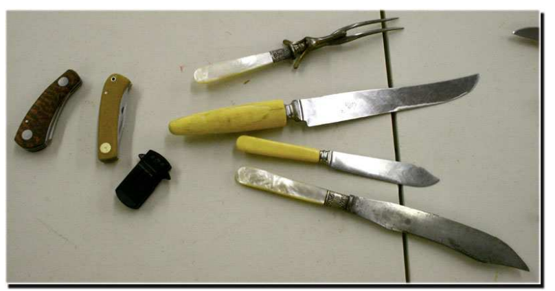
Page 2 of 10